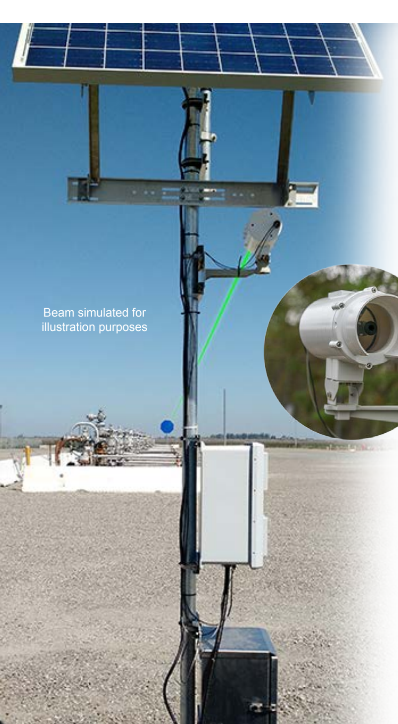
Beam simulated for illustration purposes